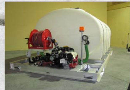
1635 Elliptical Leg Skid