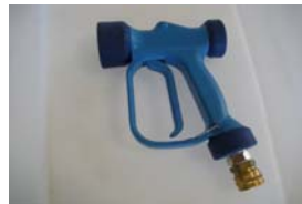
Heavy Duty Spray guns