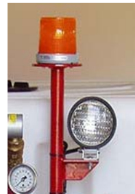
Strobe / working light Stainless pressure gauge