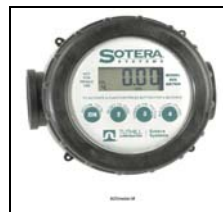
Digital Flow Meters