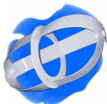
Tank Baffles Kits