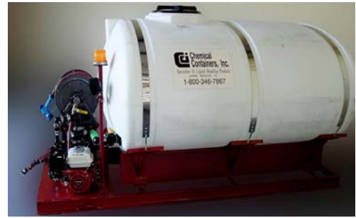
750 Gallon Elliptical