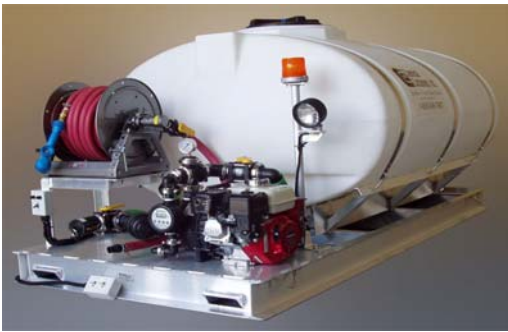
500 Gallon Elliptical