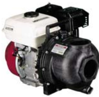
Poly Pumps w/Honda powered gas engines