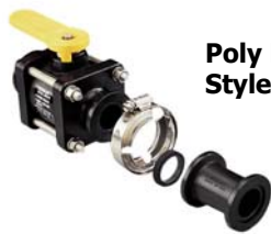
Poly Manifold Style Fittings