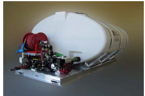
1000 Gallon Elliptical