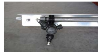
Standard 3 lane cover