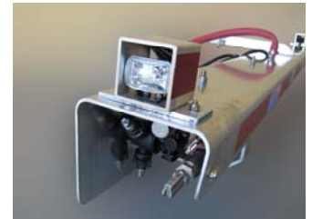
Optional: Premium aluminum hooded cover w/turret nozzle bodies/stainless steel & PVC boom pipe/single & three lane w/halogen lights on boom ends (3- lane only) Boomless nozzle on end of boom